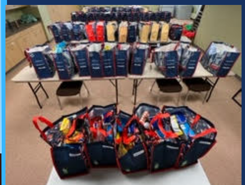
OUTREACH CLIENT HAMPERS