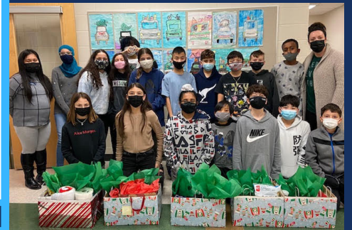
STUDENTS OF FLORENCE HALLOCK SCHOOL